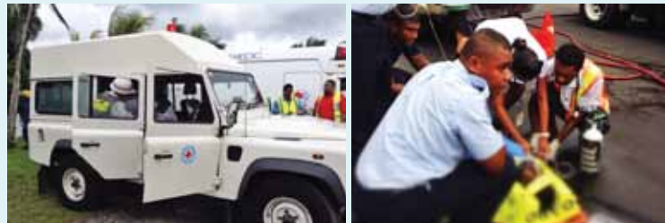
Fiji Red Cross at the 2014 Nausori Airport Crash Exercise