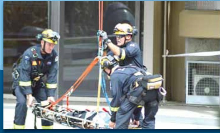
NZFS USAR Classification Exercise, 2015