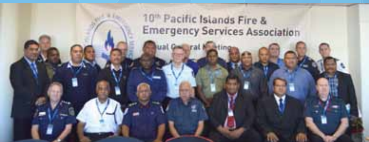
2015 PIFESA Annual Meeting, Adelaide, Australia

“Excellence in Emergency Management Safer Pacific Communities”