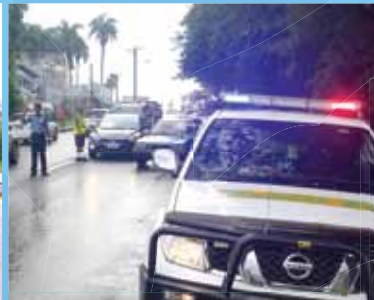
Supporting a common Incident Management System