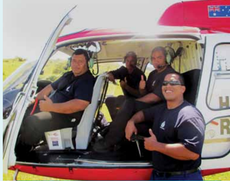
Nauru Firefighters in Tasmania, Australia undergoing training

The European Union's support project, Building Safety and Resilience in the Pacific (BSRP), is the main funder of PIEMA with the Australian Federal Police (AFP) and Donors and Development Partners also supporting the alliance.