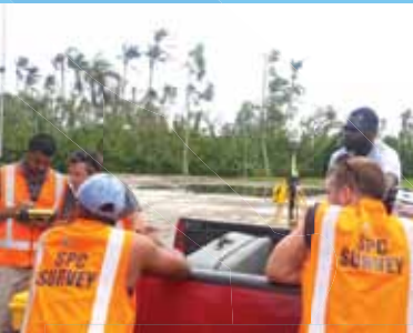
Supporting leading technology ideas for improved emergency management